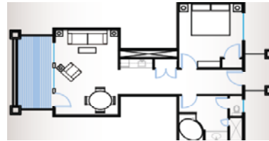
two bedroom suite